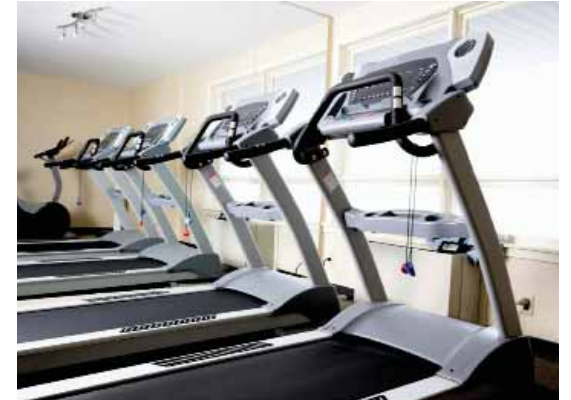
Fully Equipped Gymnasium