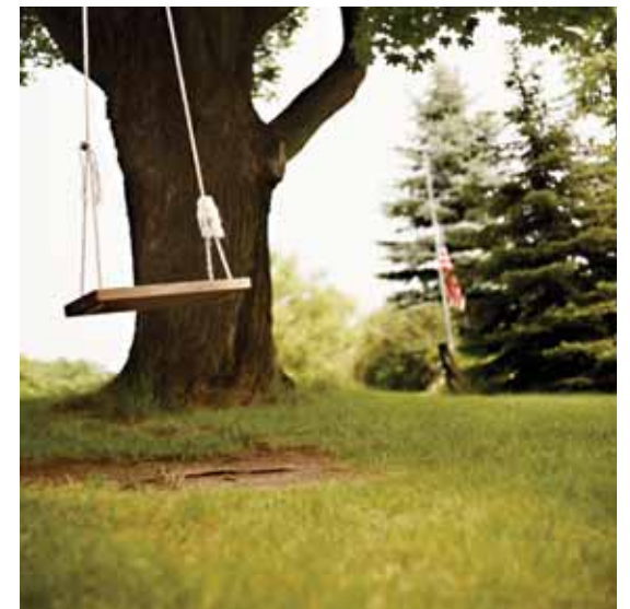
Childrens Play Area